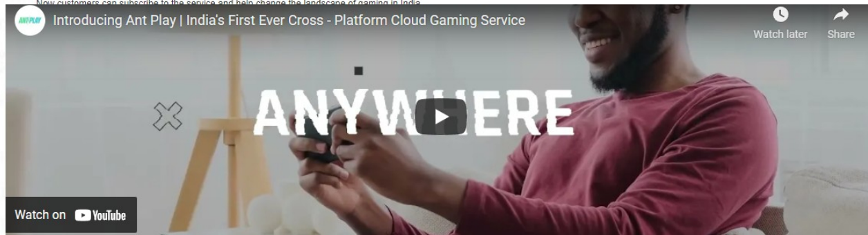
Introducing Ant Play | India's First Ever Cross - Platform Cloud Gaming Service

New customers can subscribe to the service and help change the landscape of gaming in India.